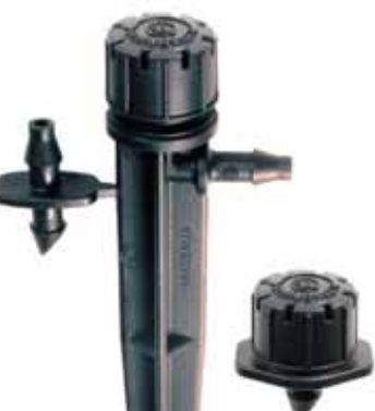
Shrubbler<sup>®</sup> Spike 0.16" with adapter